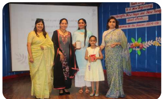
Snapshots from the Programme