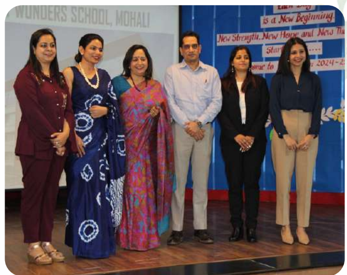
Snapshots - Teachers' Orientation Session