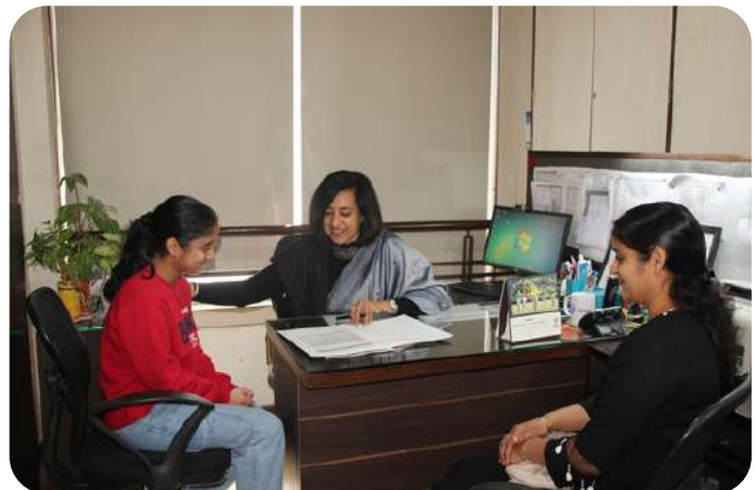
PTM - Senior Wing