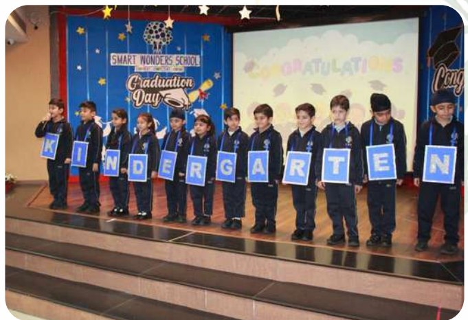
Graduation Day for UKG Students