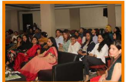
Graduation Day in Progress