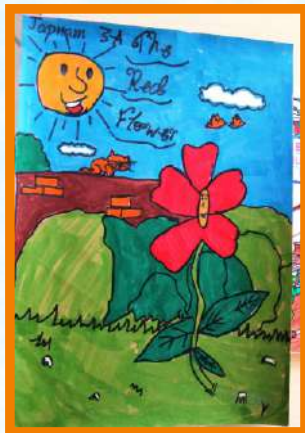
Japnam Kaur of 3A

Reading books gives us exposure to a wide range of new words and perspectives. It helps in strengthening our command over the language and sharpening our capacity in building sentence structures, as both of these are essential for being a good orator. During the library lessons, we encourage our students to browse and read books from different genres, write their own reviews; also design innovative and interesting covers for the books read by them. Besides developing independent reading habit and gaining a strong command over the language, the students also get the opportunity to share their views, thus honing their speaking skills and the ability to express themselves confidently and competently with special care of the use of right vocabulary.