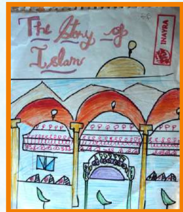
Inayra of 4B