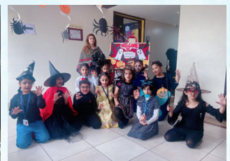
Foundation Years in their Spooky Halloween Outfits