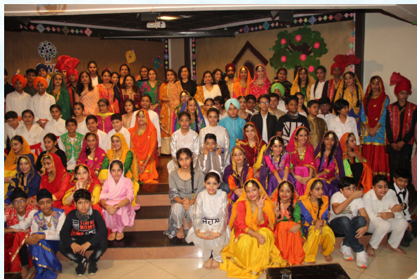
The Curtain Call and the Grand Finale