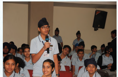
Students' Concerns Being Addressed