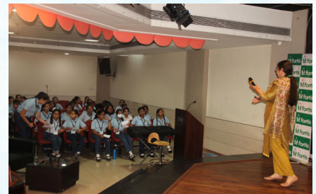
Students' concerns being Addressed