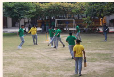
Children's Day being celebrated by the Senior Wing Students