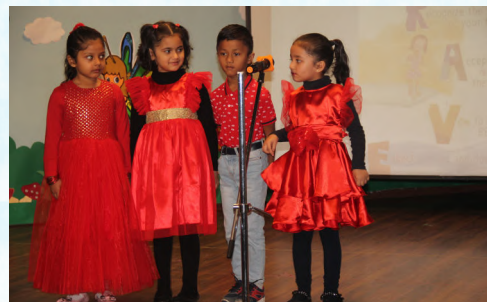
Assembly in Progress