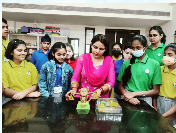
Students of Class 7 engaged in an interesting Math Lab Activity