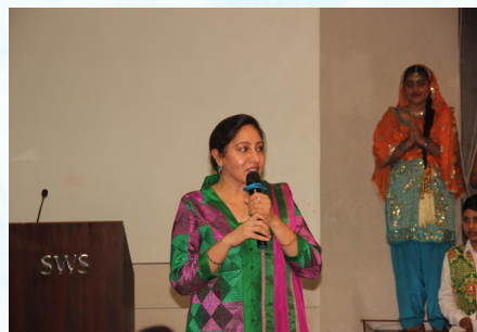
An Address by the Director