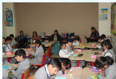
Observations in Progress