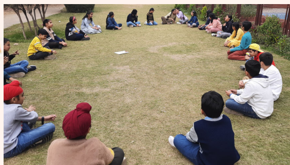
Children's Day being celebrated by Primary Years Students