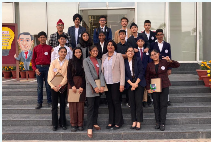
Team SWS at the host School