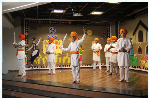
Safarnama in Progress