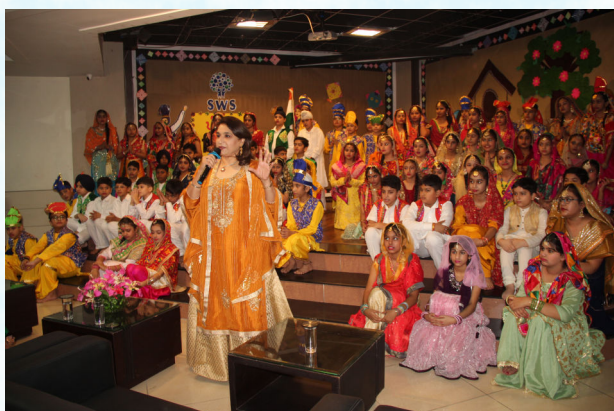
Vote of thanks by the Principal