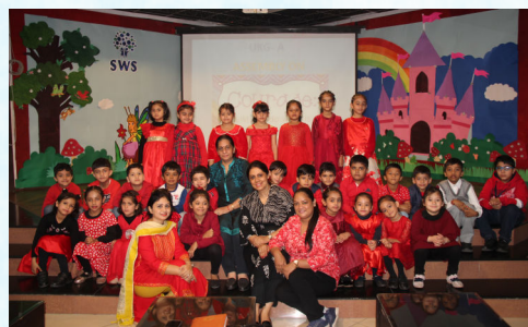
Students of UKG with their Class Teachers, Coordinator (FY) and Head (JW)