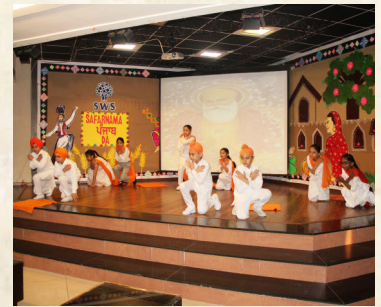
Class 3B – Assembly in Progress