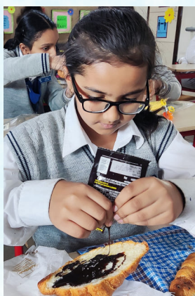
Shloka of 5A