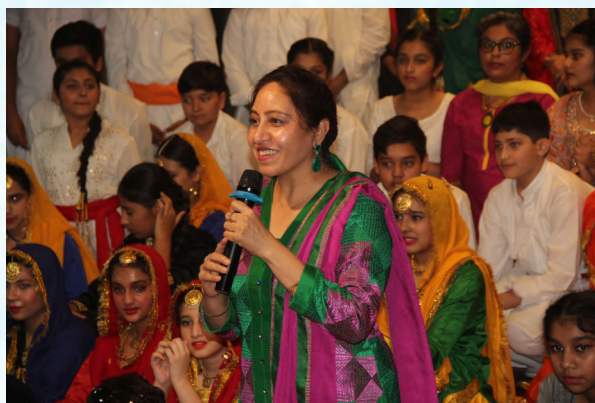
Director addresses the Audience