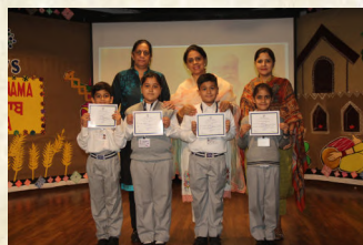
Distribution of Certificates