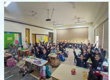
Class 4A students presenting their French Sandwich