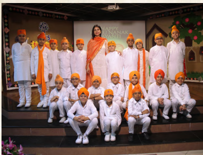
Students of 3B with their Class Teacher