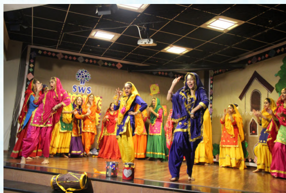
Class show in Progress