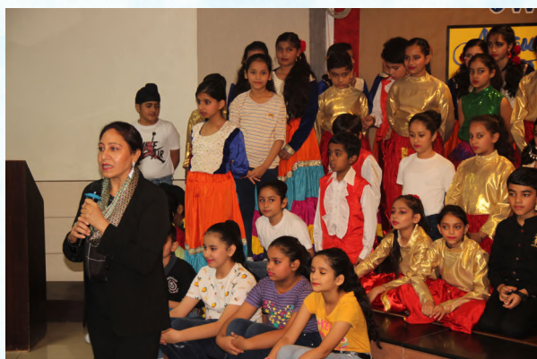
An Address by the Director