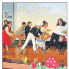
Students dancing at Smart Wonders School.

MOHALI : Students of Class 2 dressed in vibrant costumes at Smart Wonders School, Sector 71, presented a class show 'Once upon a Time' which highlighted the importance of folk tales, fables and stories, especially during the childhood period of life.