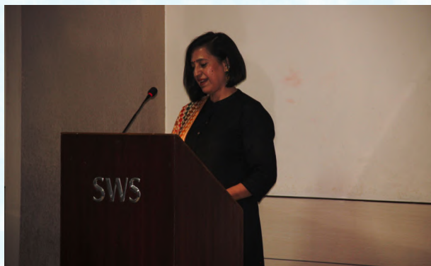
Welcome Note by the Vice Principal, SW