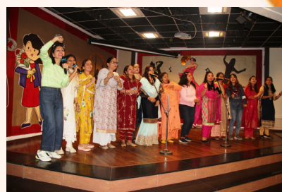
Teachers performing for the Students