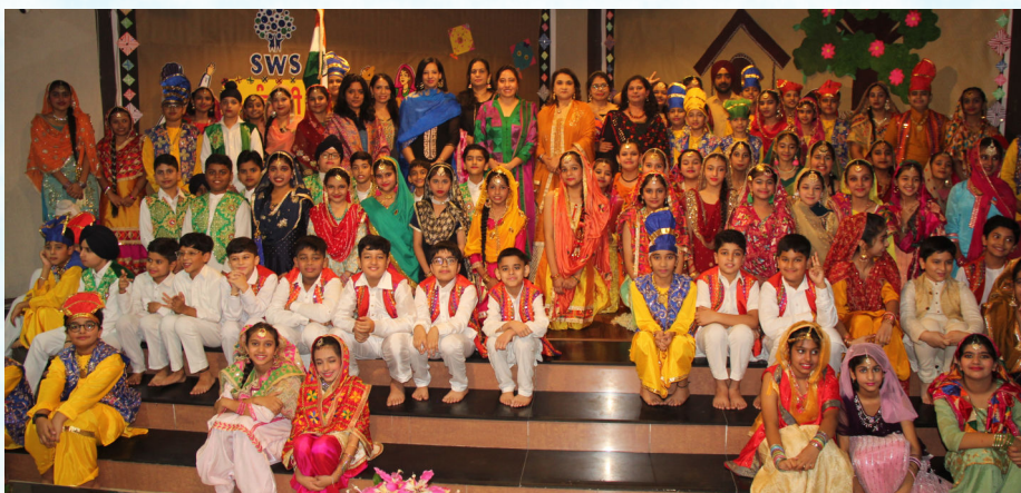
The Curtain Call and the Grand Finale