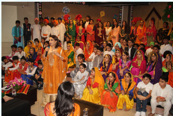
Vote of thanks by the Principal