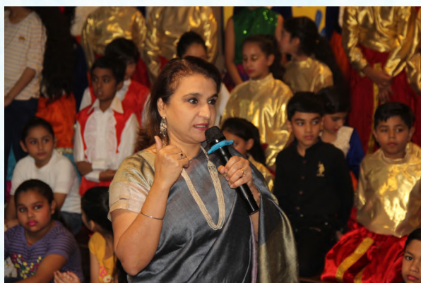
Vote of thanks by the Principal