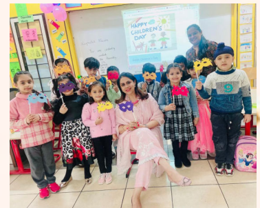
Children's Day being celebrated by Foundation Years Students