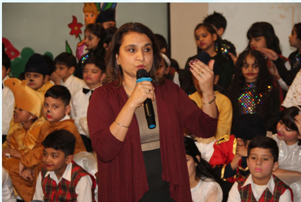
Vote of thanks by the Principal