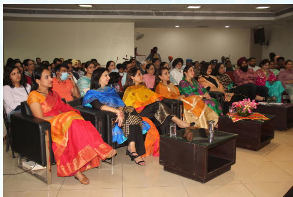
Audience enjoying the Show