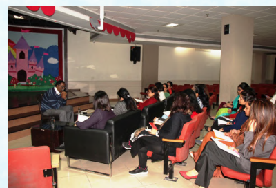
Workshop by TLC