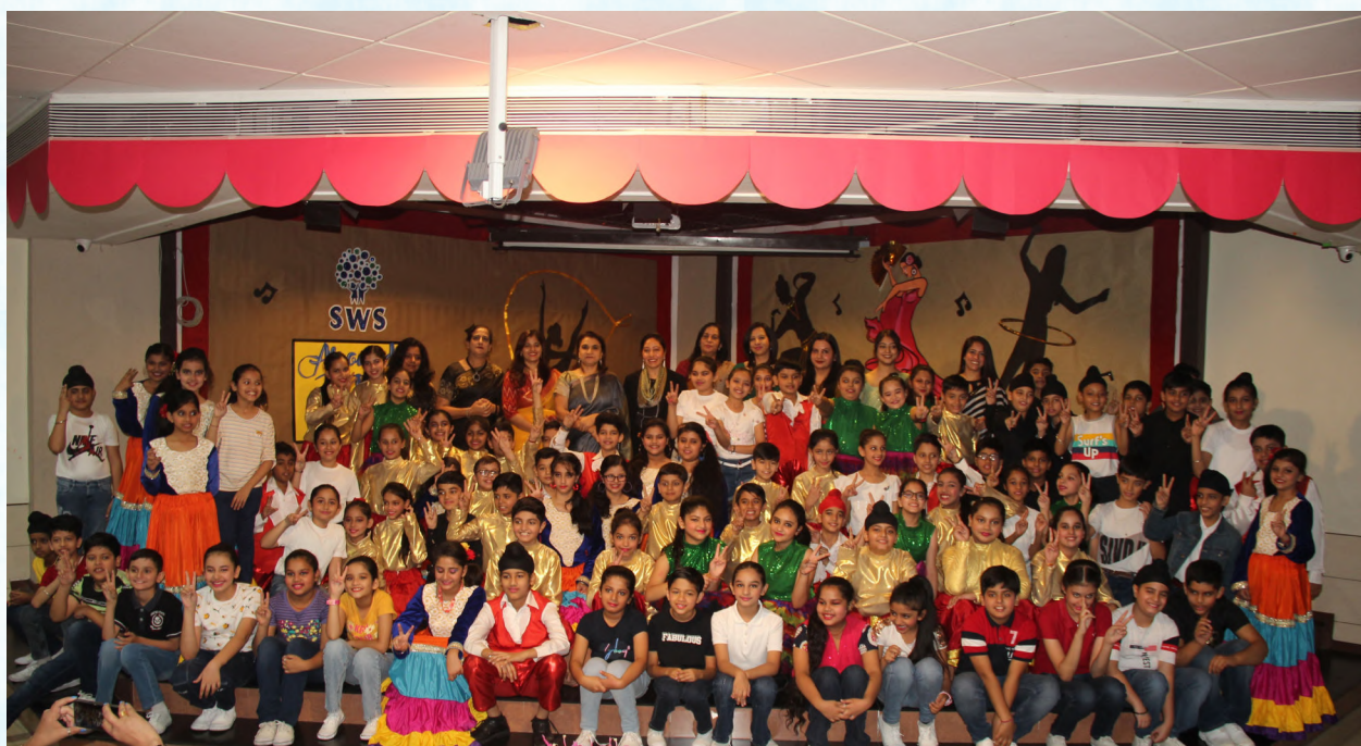
The Curtain Call and the Grand Finale