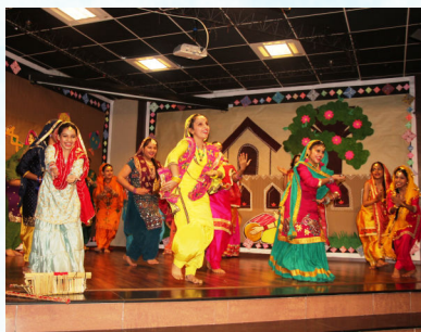
Class Show in Progress