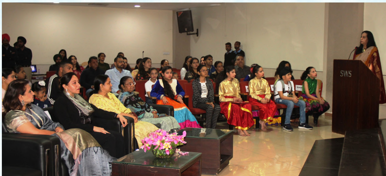
Welcome address by Head (JW)

The spectacular show took everyone on a joyride which was full of dance, drama, music and some interesting facts from places around the world. Students, adorning colourful and vibrant attire, owned the stage with immense talent as they demonstrated the startling similarities and differences in the cultures and significant art forms of Asia, Africa, Europe and America. Foot-tapping songs and enthralling dance performances left the audience spellbound.