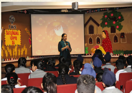
Address by the JW Head