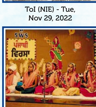
Students participating in Punjab Virsa show.