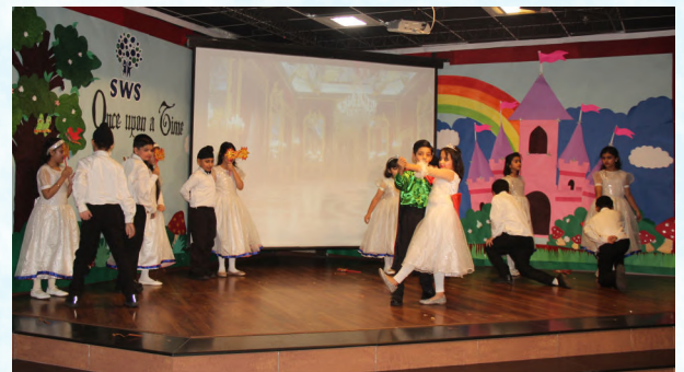
Class Show in Progress