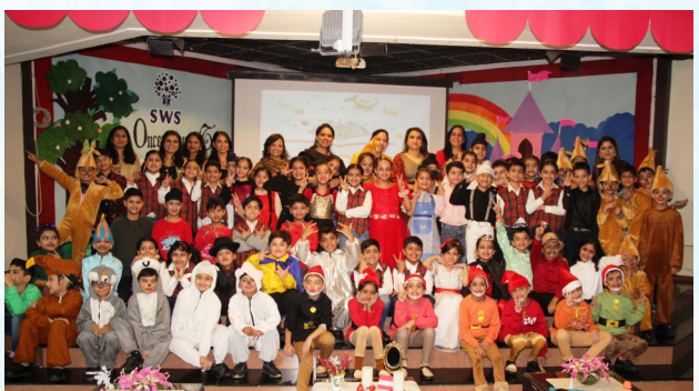
The Curtain Call and the Grand Finale