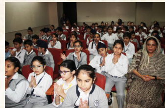
Class 1D – Assembly in Progress