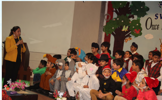
Address by the Director