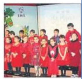
Students during the special assembly held on topic 'courage'.

MOHALI : UKG students of Smart Wonders School, Sector 71, presented a special assembly on topic 'courage'. The assembly began with the thought for the day, explaining how everything in life comes from hard work, strength and courage. Students sang a melodious song and recited some inspiring poems. A group dance was also performed by them.