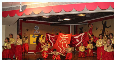
Class show in Progress