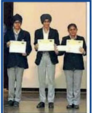
Smart Wonders students at the Tricity Dronathon.